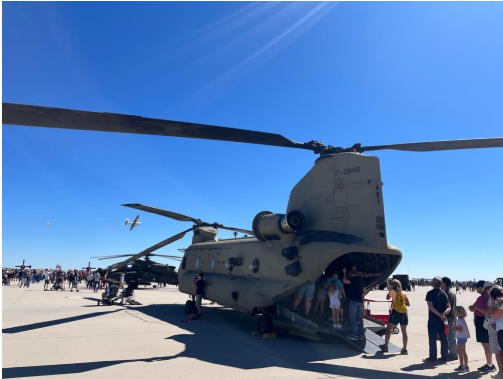
Participants stand in line to experience the inside cabin of the CH-47 Chinook at the Pike's Peak Regional Airshow, Sept. 24, 2022. The B-25 Mitchell could be seen flying in the distance.